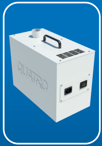
BASIC Portable Dust Extractor Model: BA-FA11