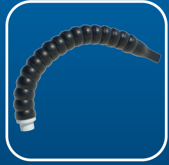
Extraction Arm Source Capture PN: AA304