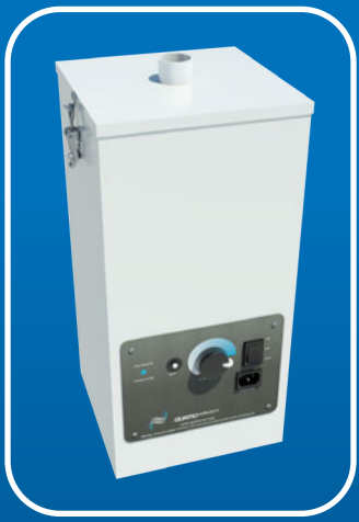
medEVAC mini Compact Dust Extractor Model: MEm-117LRK