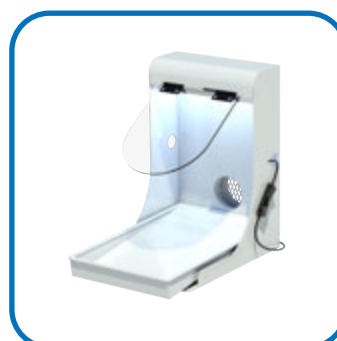
LED SplashGuard (AA083-2.5S)