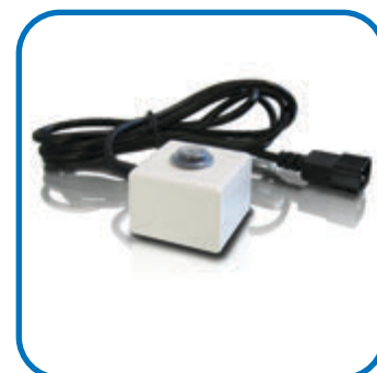
Hand Switch (AA011)