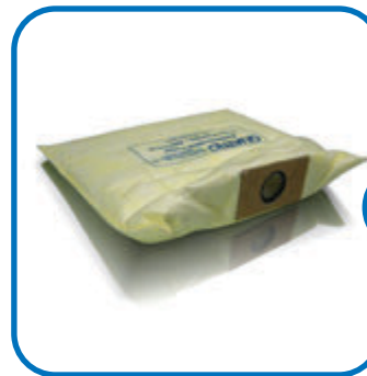
Bag Filter (AG113)